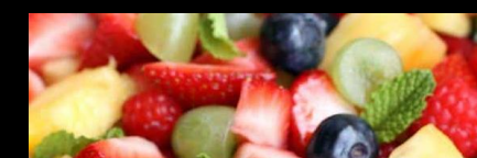
Fresh Fruit Salad