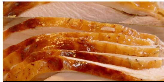
HAND CARVED OVEN-ROASTED TURKEY ON OUR SANDWICHES!

Our own special recipe, white tuna mixed with low-fat mayonnaise, served on ciabatta bread with lettuce and tomato.