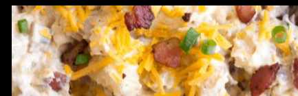
Twice- Baked Potato Salad