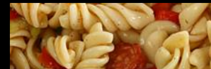
Italian Pasta Salad

House Made Chips, Potato Chips, Garden Salad, Caesar Salad, Italian Pasta Salad, Twice- Baked Potato Salad ,Fresh Fruit Salad, and Whole Fruit.